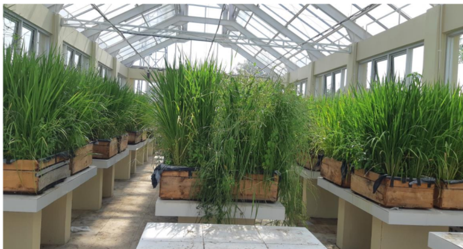
Figure 2. Photo of the experimental culture at 60 DAP

The same works were done for all weed species that grew in all sample plots. Each weed species from each treatment was entered in paper bags and was dried for one week in the solar thermal. All treatments were done in the same way. Each weed species in the paper bag was dried in a Binder drying oven ED series for 48 hours at 80 °C or until the dry weight was constant. The weed dry weight was calculated according to the species, while weed dry weight was calculated from all weed species in one wooden box. Weed dry weight was measured using the ACIS AD-i Series digital analytical balance.