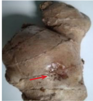
Figure 3 Ginger rhizome infected by Fusarium oxysporum f. sp. zingiberi . The symptoms involved slight wrinkled, brown, deep and wide sunken area and dry rot.

Meanwhile, the longest incubation period was 12 days or 44.42%, which occurred in TPO5 isolates; this number is longer than the