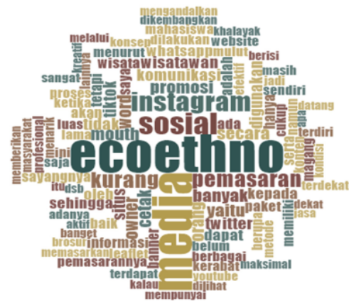
Figure 3. Word Cloud of Development Models

In the marketing communication media section, the researcher made a data visualization in the form of a Word Cloud, to see the words that often appear in the Ecoethno marketing communication media code in Figure 3. Based on the results of processing with NVivo, many words that often appear in marketing communication media codes mention Ecoethno as a unique jargon or brand, then social media is widely used as a source of information and as a strategy carried out by Ecoethno Leadcampsite, namely Instagram, Twitter and Tiktok Word. of Mouth. So internal marketing through small commercial advertisements is carried out by Ecoethno Leadcampsite.