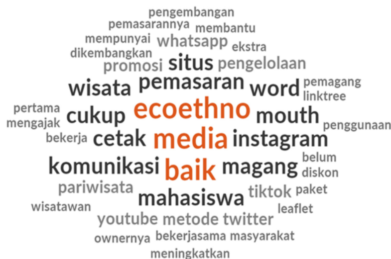
Figure 1. Word Cloud Analytics Models