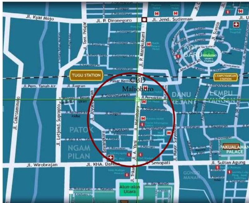
Fig. 1: Study area in CBD Malioboro, Yogyakarta, Indonesia

4 d in actual condition that potentially cause traffic jam. Traffic is congested if there are so many vehicles that each one travels slower than it would do if the other vehicles weren't there and traffic is congested if there are so many vehicles that they are brought to a standstill or 13 only crawl along. Related with speed and traffic flow congestion is defined as the impedance vehicles impose on each other, due to the speed-flow relationship, in conditions where the use of a transport system approaches its capacity. The travel time in free-flow speed condition of motorcycles in CBD Malioboro, Yogyakarta is obtained based on formula Indonesian Highway Capacity Manual (IHCM) 1997. The travel time in actual cost condition is obtained from Moving Car Observer (MCO) survey in Central Business District (CBD) Malioboro, Yogyakarta. The CBD Malioboro consist of two lane one-way direction undivided road (2/1 UD) 1.414 km long from Malioboro Street to Ahmad Yani Street. The collection of data in the study area CBD Malioboro, Yogyakarta, Indonesia as can be seen in Fig. 1.