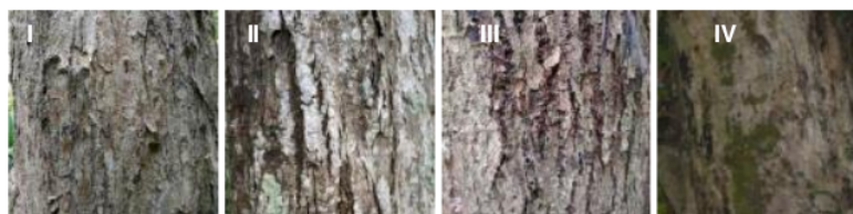
Figure 2. The bark surface of the epiphytic orchids host trees. Notes: (I) Teak ( Tectona grandis ); (II) Putat ( Barringtonia acutangula ); (III) Bulu ( Ficus annulata ); (IV) Bungur ( Lagerstroemia speciosa ).

The trees found as host trees of epiphytic orchids in this research generally have the same physical characteristics, which have hard stems, cracked surface texture, rough, mossy and not easily peeled can be seen in Figure 4.6. The bark of each type of tree has distinctive physical characteristics and properties. Some of the characteristics of tree bark that influence the presence of epiphytic plants include not easy to peel, rough, hard, able to catch water, neutral acidity, and the presence of nutrients in the bark (Atmaja & Pamuji, 2011). In each tree trunk where the epiphytic orchid attaches has a thin thickness of moss. Moss plays an important role in the germination and growth of epiphytic orchids (Alvarenga et al. , 2010).