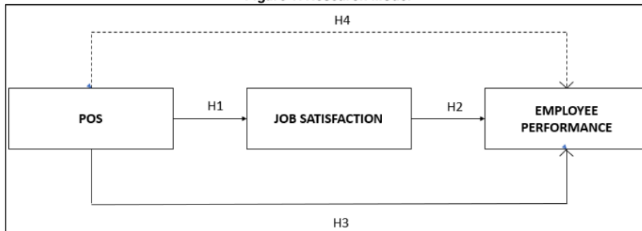
Figure 1. Research Model

H4: Job satisfaction mediates the relationship between POS and employee performance.