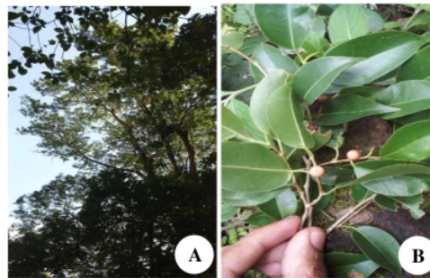
Figure 2. Ficus benjamina : A. Tree, B. Fruit