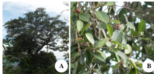
Figure 3. Ficus sinuata : A. Tree, B. Fruit