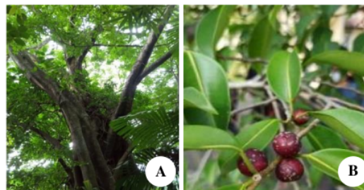
Figure 4. Ficus kurzii : A. tree, B. fruit