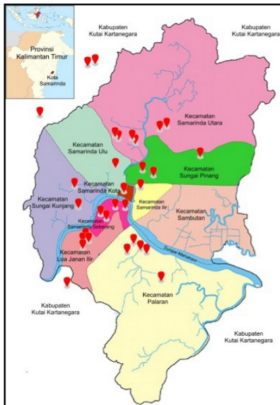
Fig. 1. Distribution of thalassemia patients in Samarinda City, East Kalimantan.

improving the quality of life of patients [5].