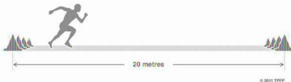
Figure 1. Multi-stage Fitness Test

VO 2 max examination: A change to VO 2 MAX was examined using a Multi-Stage Fitness Test method with a run from one sign to another sign at a distance of 20 meters and in harmony with previously recorded sound. Subjects were required to follow the rhythm as long as possible and the test was ceased when subjects fail to reach the end of the 20m track for 2 stages or get exhausted 9,10 .