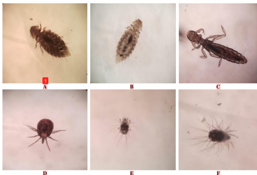
Figure 2. Ectoparasite species found in kampong chickens at five sampling sites. A. Menopon gallinae ; B. Menacanthus cornutus ; C. Lipeurus caponis ; D. Haemaphysalis sp.; E. Dermanyssus gallinae ; F. Megninia ginglymura

1 The results of this study are in line with the majority of studies that found Men. gallinae with the highest prevalence. Suhaila et al. (2015) in North Malaysia found four species of ectoparasites, consisting of three lice and a tick, the highest prevalence being of Men. gallinae (93.8%), followed by Me. pallidulus (81.3%), Haemaphysalis sp. (10.5%), and L. caponis (18.8%). Furthermore, Men. gallinae was also the most common ectoparasite with 76.7% occurrence, followed by L. caponis (63.3%) in Penang Malaysia (Rahman and Haziqoh 2015). The same results were found by Ilyes et al. (2013) in their research in Algeria, with the highest prevalence was Men. gallinae (97%), followed by L. caponis (41%), and Me. cornutus only 20%. The dominance of Men. gallinae was also recorded by Deepthali et al. (2005) in India, Prelezov and Koinarski (2006) in Bulgaria and Marin-Gomez and Benavides-Montano (2007) in Columbia. In Benin, three