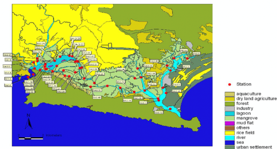
Figure 1. Sampling stations in Segara Anakan, Cilacap (Nordhaus, 2009)