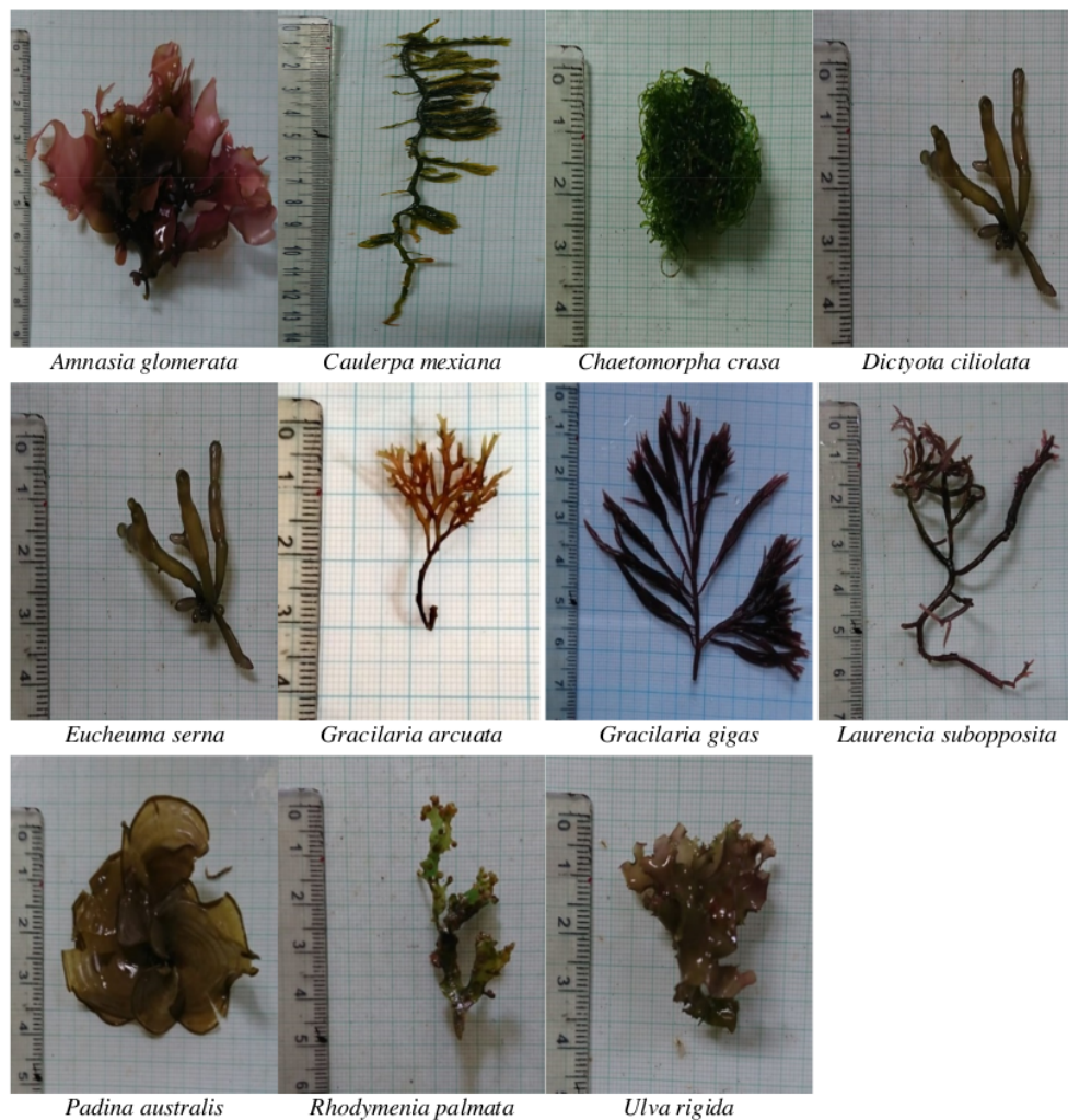
Figure 1. A voucher specimen of macroalgae found in Karang Bolong Beach, Nusakambangan Cilacap

The Shannon-Wiener diversity index ( H' ) of macroalgae in Karang Bolong Beach ( H' ) in the composited was 0.2092–0.5660 while the H' value in the coral substrate was 0.6426–1.4480, which meant low to moderate diversity (Table 1). Interpretation according to [14] and [16], if the value of H' < 1 diversity is low, 1 < H' < 3 is medium diversity, and H' > 3 is high diversity. According to [5] the variety of macroalgae species was influenced by the type of substrate, stability, surface hardness, and porosity of the bottom substrate.