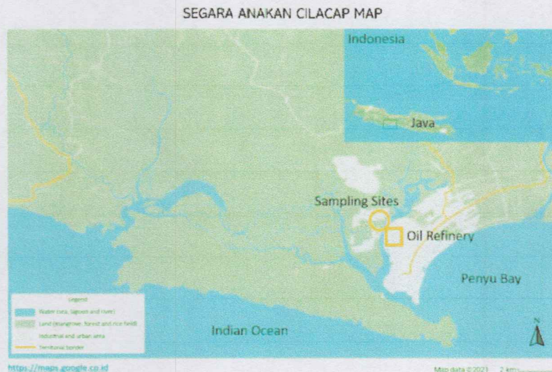
Figure 1. Map of the sampling sites in Segara Anakan lagoon, Cilacap District, Central Java, Indonesia