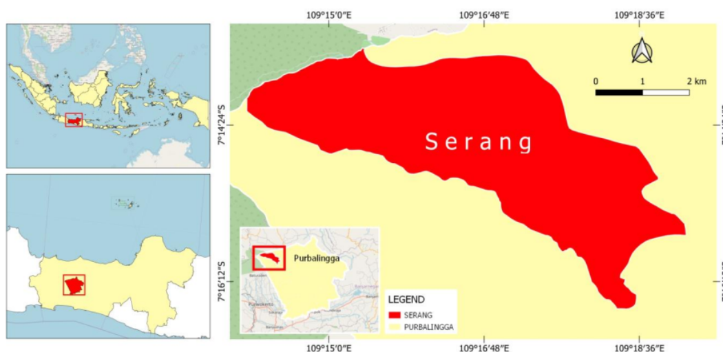
Figure 1. Study area map showing the location of the research site in Central Java, Indonesia

Where, E is the Evenness index, H' is the Shannon-Wiener diversity index and S is the total number of wild bee species.