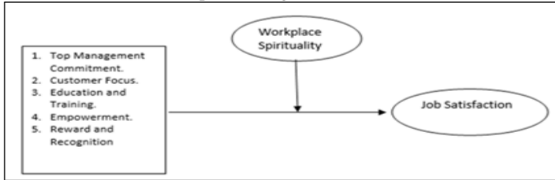
Figure 1: Conceptual Framework