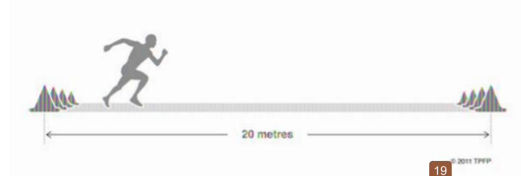
Figure 2. Multi-stage fitness test [7], the subject was asked to run back and forth on 20 metres track following the speed of the sound played in the sound player.