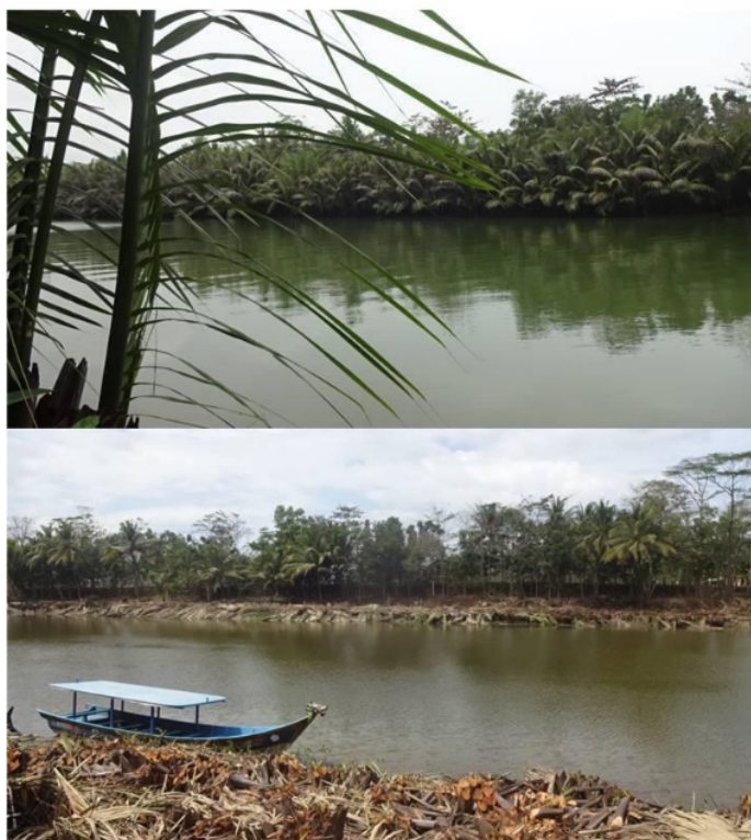
Figure 1. Damages in landscape from nypa forest to nothing at River Tipar Adipala Cilacap.

Nypa palm are very useful for people in the surrounding areas. The long, feathery leaves of the nypa palm are used by local populations as roof material for houses. The leaves are also used in many types of basketry. In some areas the leaves are also used as fish attraction by waving. The young leaves are used to wrap tobacco for smoking. Large stems are used to train swimmers in Burma as it has buoyancy. In 2000 the Nigerian Conservation Foundation (NCF) began project to assist local communities with the manufacture of jewellery from nypa palm. Nypa can also be used to produce alcohol, sugar and vinegar [6].