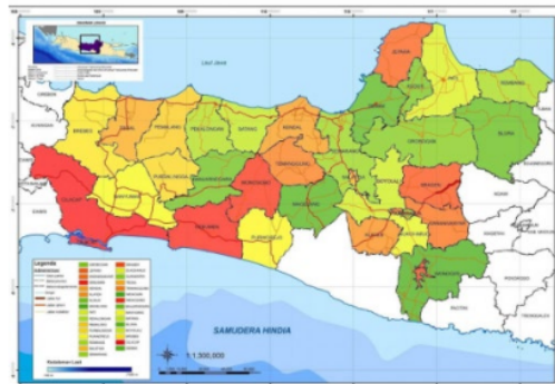
Figure 1 Map of Central Java Province

The data used in this study were taken from BPS statistics (central Bureau of Statistic) of Central Java province. Central Java Province consists of 35 districts. HDI for a collection of geographic areas are commonly display on maps. The Map of Central Java Province is presented in Figure 1. In this study, we use the human development index (HDI) as response variable, population, number of poor people, gross enrollment rate, district minimum wage and poverty line as predictors variables (Table 2). Summary statistics for these variables are shown in Table 3.