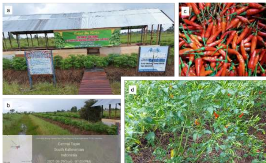
Figure 2. Hiyung chili farm (a, b), chilli fruits (c) and chilli-bearing mature plants (d).

produced by endophytic fungi [15, 39], which include cell elongation and division, and is a part of the plants' defence system. It was documented that different IAA biosynthetic pathways regulate different types of plant-microbial interactions [42].