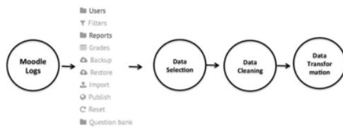
Fig 2. Data Pre-Preparation Process in e-Learning

Figure 2 illustrates on Data Pre-Preparation Process in e-Learning. In the initial section, researchers get Moodle Logs that contains several important attributes include User Logs, Filter, Reports, Grades, Backup, Restore, Import, Publish, Reset, and are also Question Bank. At this point it should be ensured that all the attributes that have activity logs can be lifted with a good and perfect. Stage 2 is a Data selection, where the system will ensure that data will be processed first through the selection process so that not all the attributes to be processed in parallel. Then, in Phase 3 Data Cleaning is done where the system will do the cleaning or filter the data logs that have interests in accordance with the objectives and key researchers when conducting mining. Lastly, is Stage 4 is Data transformer, where the system has completed the process by doing a full transformation of the mining activities undertaken.