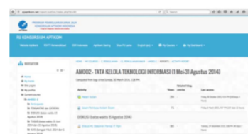
Fig 1. Moodle Log Report Screen

LMS Moodle system is a well-known open source software for learning management system in particular that offers teachers to create and manage an online class effectively. The students should not be required to attend courses in the room, to do the exercises and projects, as well as to take the exam in class. Also, in class e-Learning, students need to take a pre and post quiz online, to review and use materials from e-Learning systems and to participate in the assignment or discussion.