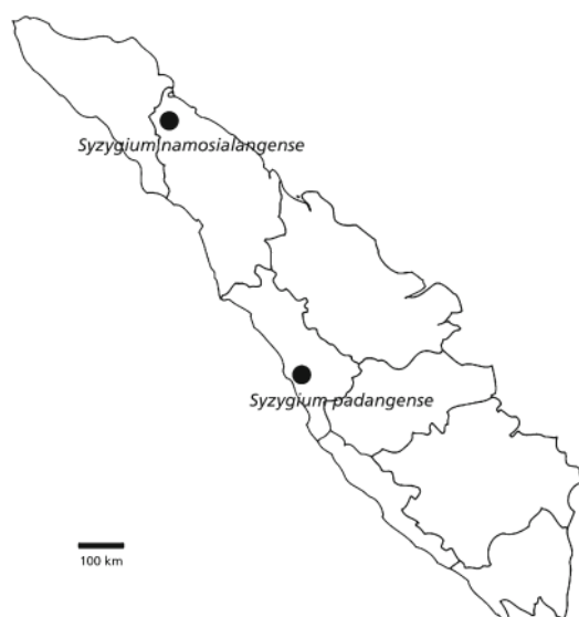
Map 1. Distribution map of Syzygium namosialangense and S. padangense (d-maps.com 2007)

Kabung, in the southernmost part of Padang City. While the area to the south of Padang remains relatively well forested, this area has no formal protection. The area has not been subject to recent floristic surveys, making it impossible to determine the abundance of this taxon or specific threats to it.