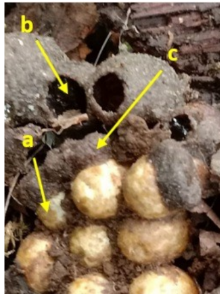
Figure 2. Nest composition: a) brood cell, b) honey cell, and c) pollen cells.

Morphological observations showed that the body is black, the wing tips are brown, the wings reflect a metallic blue. forelegs, middle and back parts of the tibia and tarsus are orange (Figure 3a and 4a). Mid legs, femur, tibia and tarsus are lights brown (Figure 3b and 4b) and the hind legs femur, tibia and tarsus are brown (Figure 3c and 4 c). Front of the heads is black (Figure 4d.). However, our weakness is that we are not able to distinguish between working queens and males, so the data is displayed without any information on caste or gender. Sample body length ranged from 19 – 22 mm (table 1).