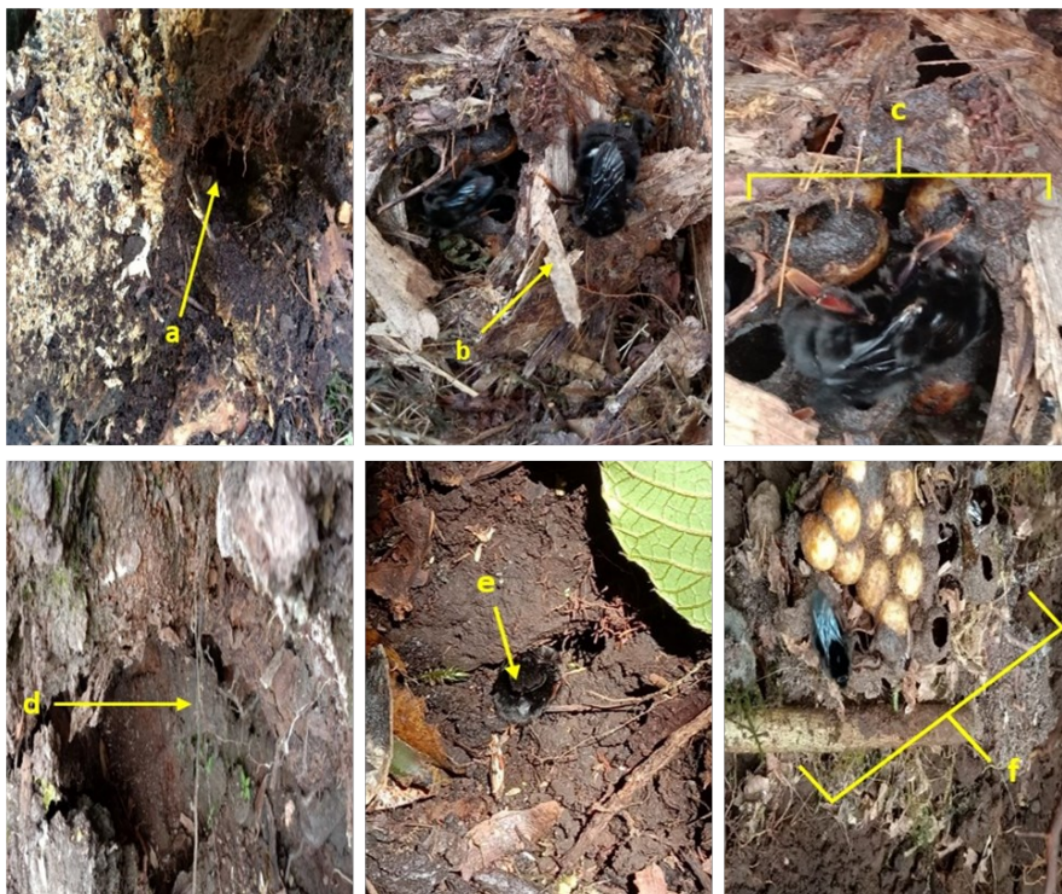
Figure 1. Nest structure: a) nest hollow, b) nest material with moss, c) worker in the nest d) location, e) entrance, and f) nest composition.

The nest of B. ruficeps found at Mt. Slamet consisted of 8 to 12 brood cells, 5 to 8 honey cells, and 5 to 6 pollen cells (Figure 2), and differ from the findings of Kato et al. (1992) which showed the number of colonies found to be up to 46 cells. B. rufipes has small colonies compared to other Bombus species in Southeast Asia (Liang et al. 2020).