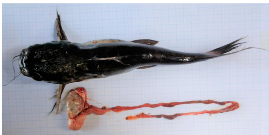
Figure 2. Body and intestine length of Neoarius leptaspis

The relative gut length (RGL) measurement. The relative gut length was calculated by dividing gut length (GL) by standard body length (SL). The calculation was performed using the following formula (Gupta and Banerjee 2014; and Alabssawy et al. 2019).