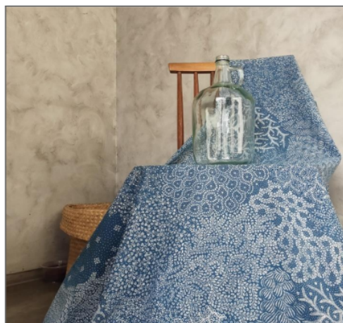
Figure 1. Natural Dyed Batik (Indigo)