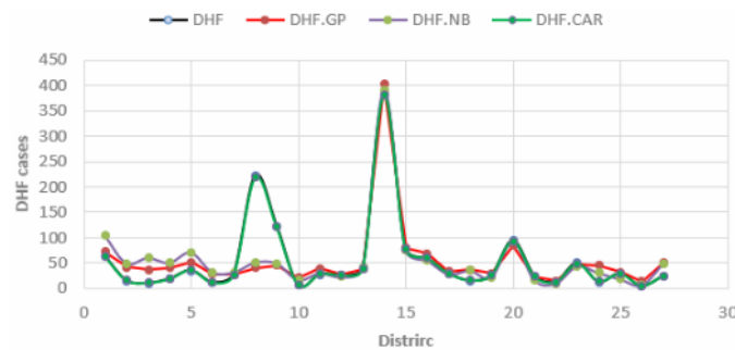
Figure 2. Plot of DHF actual and DHF predictions.

Furthermore, to calculate the relative risk of DHF for each district in Ciamis regency, we selected the best model by using the root mean square error (RMSE). Figure 2 shows accuracy model by using plot between DHF actual and DHF prediction.