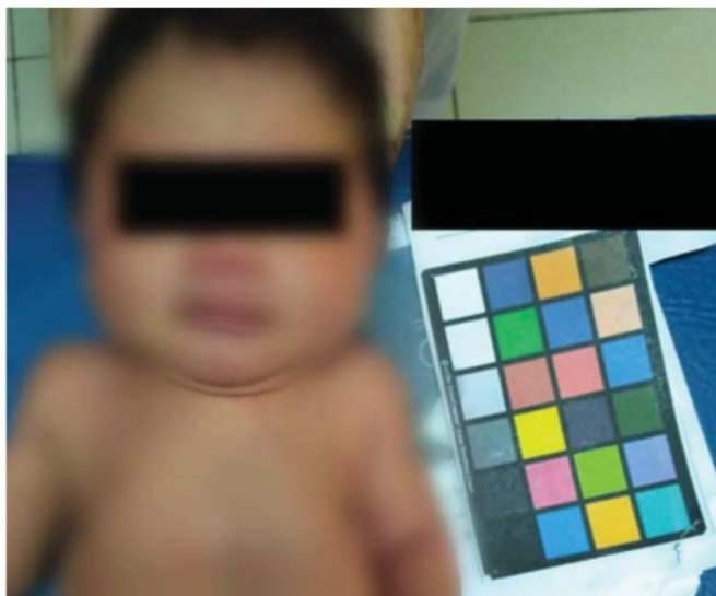
Figure 1. Neonatal forehead image capturing with a reflective color chart reference.

Neonatal forehead images were captured using smartphone camera (Redmi, Camera 13 MP, f/2.0, PDAF) under sufficient lighting without using camera flash. A printed reflective color chart reference[14] has been place besides the neonatal ( Fig. 1 ). Photograph of neonatal forehead was taken at a distance about 50-60 cm for 3 times.