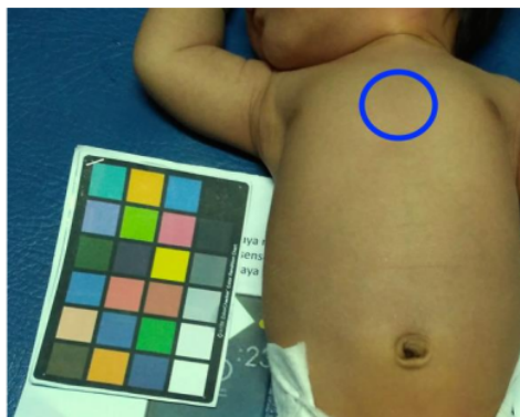
Figure 1. Smartphone camera could be used to predict the newborn blood bilirubin concentration. Observed site was marked in blue circle, standard color chart was prepared for correction.

The chest photos have been captured using a smartphone camera (Redmi, Camera 13 MP, f/2.0, PDAF) under sufficient lighting without using camera flash. The photo capturing condition in the care room with white regular room light. A printed standard color chart as references [10] has been prepared and placed besides the newborn infant ( Fig. 1 ). The photo capturing was performed at a distance of about 50-60 cm.