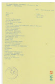
Receipt of the payment RJC-5443 2019.jpg 308K