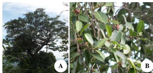
Figure 3. Ficus sinuata : A. Tree, B. Fruit