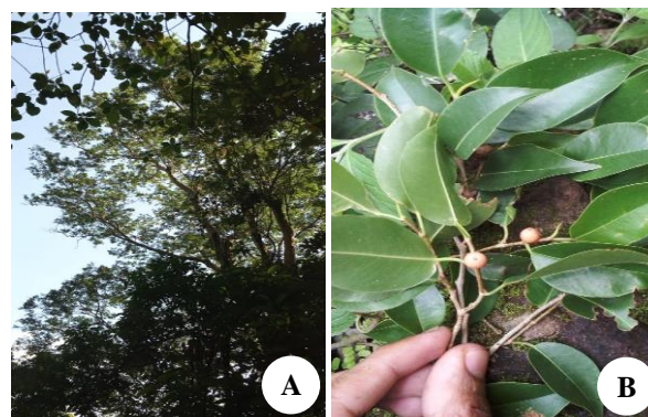
Figure 2. Ficus benjamina : A. Tree, B. Fruit