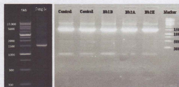
Figure 2. Visualization of the amplification product of the 16S rRNA gene (marker: 1 kb DNA ladder)

The potential Bifidobacterium isolates were re-cultured on the MRS Agar medium at 37 °C for 3 days, anaerobically. The growing colonies were observed as round shaped, creamy white, shiny surface, raised elevation, and flat edge (data not shown) colonies. The single colony was examined by Gram's staining, morphological characterization, and catalase test. Morphological characterization re-confirmed that all isolates were Gram-positive and rod-shaped cells.