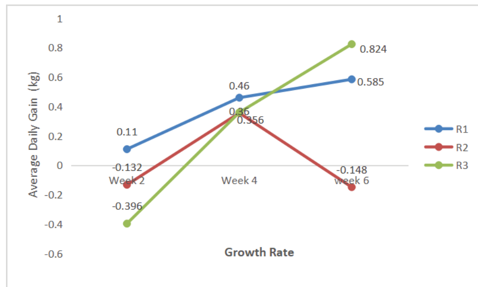
Figure 1: Growth Rate of Sheep During Experiment.

optimal. As reported by [19], the lowering sheep growth rate was mostly influenced by the antinutrition factors contained by the feed, such as tannin, the efficiency of feed utilization associated with increasement intake of antinutritional factors.