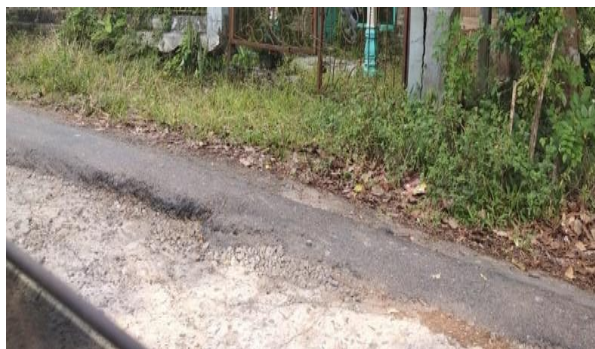
Figure 2 Road sinking due to lands under it landslides.

Trustworthy infrastructure damage is a result of gold mining not only in houses, but also in the roads around mine wells. This can occur because excavation in mine quarries is not only vertical but also horizontal. Miners when digging horizontally sometimes encounter diggers from other groups' queries. Horizontal excavation is what is possible to have an effect on the damage to the road, because of the direction without being restricted, the barrier is the vein of the gold content. In addition, many mine holes are dug not far from the road [4].