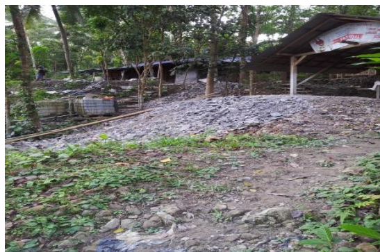
Figure 1 Tailings covering the land.

Before the existence of gold mining in the mining area, especially in Paningkaban and Cihonje villages, it was included as fertile and full of thick and heavy plants. However, after many mines were dug up on the land, and a lot of tailings were wasted on the surface of the land, which reduced the soil fertility to a lesser extent which in turn reduced existing vegetation. This happens because the remaining tailings are rocks which become difficult for plant media. Figure 1 is a bit of a change in land in the gold mining area.