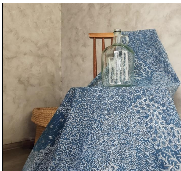
Figure 1. Natural Dyed Batik (Indigo)