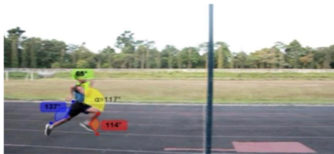
Figure 1. The result of Kinovea analysis for 100-Meter run

The division of groups, according to the initial series of test of 100-meter run for twice within 12,00 seconds limit, produce 2 groups. First group is aerobic group within 12,00 second limit consists of 30 samples. Second group, anaerobic group consists of those who spent more than 12,00 seconds consists of 30 samples.