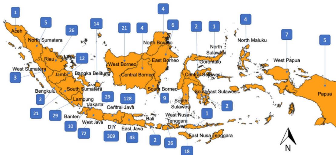
Figure 1 Participant number and the distribution by the province in Indonesia.

Logistic regression test was applied to see the association between knowledge and practice category and socio-demographic respondent. Knowledge and practice were divided into two groups – poor and good – less than the mean score categorised as poor and vice versa. Significance was determined at 5% level ( P -value \leq 0.05 ). The attitude was analysed using chi-square test and last the information needs and information-seeking behaviour was presented descriptively.